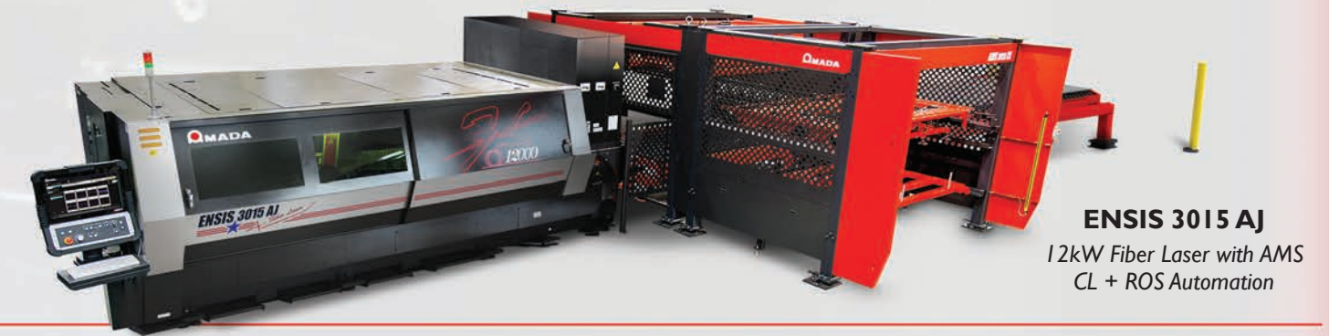
ENSIS 3015 AJ 12kW Fiber Laser with AMS CL + ROS Automation

AMADA AUTOMATION PROVIDES PROCESS FLEXIBILITY AND MAXIMUM PRODUCTION.